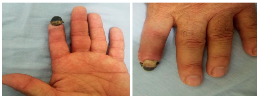
FIGURE 3: Photo of the patient's left hand showing the gangrenous distal phalanx of his left index finger.

Health Organization released in March 2021 that the available data on AstraZeneca did not show any increased risk of clotting events despite having few cases reported on unique thromboembolism [10]. The earliest reported cases were the atypical venous thrombosis, mainly intracranial [1], which were challenging to treat [9]. Young females were mostly affected [1] and mostly presented within one to two weeks after receiving the vaccine [1, 9, 10]. The great majority of patients were previously healthy and fit [11]. So when a patient presents with headache, abdominal pain, shortness of breath, and/or limb swelling postvaccination, a platelet count and imaging for thrombosis must be carried out [12].