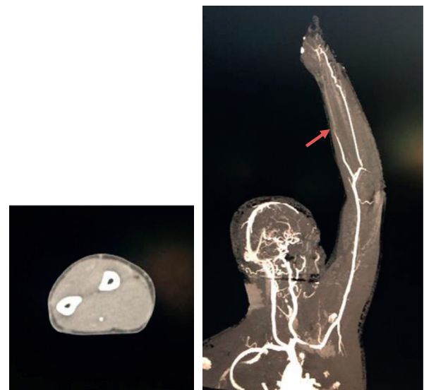
FIGURE 2: IV contrasted CT scan showing occlusion of the left radial artery at the level of the midforearm with retrograde filling at the level of the left rest.

The patient was admitted under the care of the cardiovascular team as a case of upper limb ischemia for observation and therapeutic anticoagulation. Four weeks later, our patient presented to the clinic with improvement of his symptoms and reversal of tissue ischemia except for dry gangrene in his distal phalanx of the left index, which was left for autoamputation (Figure 3).