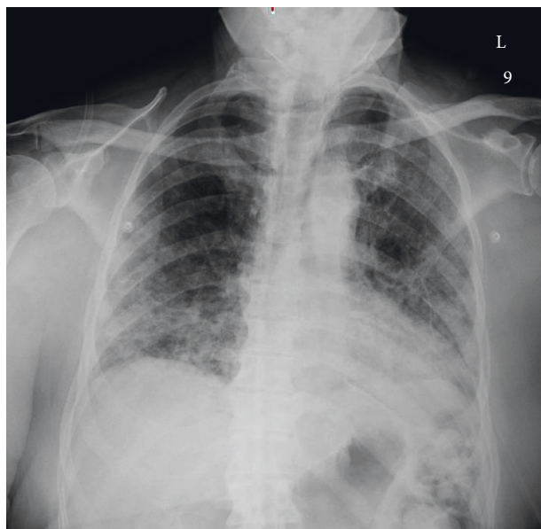
FIGURE 1: Chest X-ray anteroposterior on admission: moderately extensive bilateral patchy airspace disease.

The fasciotomy extended to the entire volar forearm and half of the dorsal forearm and across the volar wrist and on the dorsum of the hand.