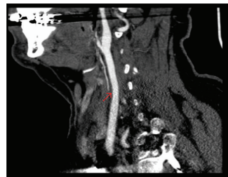
FIGURE 2: Sagittal CT angiogram of the neck (3 months later) showing very minimal mural thrombus remaining.

The severe iron-deficiency in this case was attributed to a gastrointestinal source. The patient received intravenous iron replacement and was bridged from heparin to warfarin with the aim of achieving an International Normalization Ratio (INR) of 2 to 3. He was discharged home without any deficits on low dose aspirin and warfarin as well as oral iron replacement therapy with a plan for repeat vascular