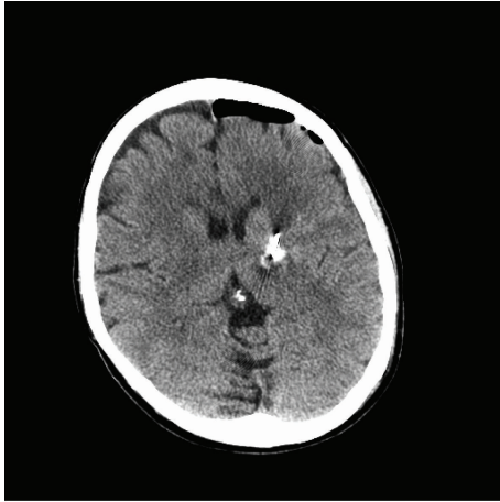
FIGURE 1: CT head demonstrated a small hemorrhage at the tip of the lead.

demonstrated no benefits. Revision surgery was recommended.