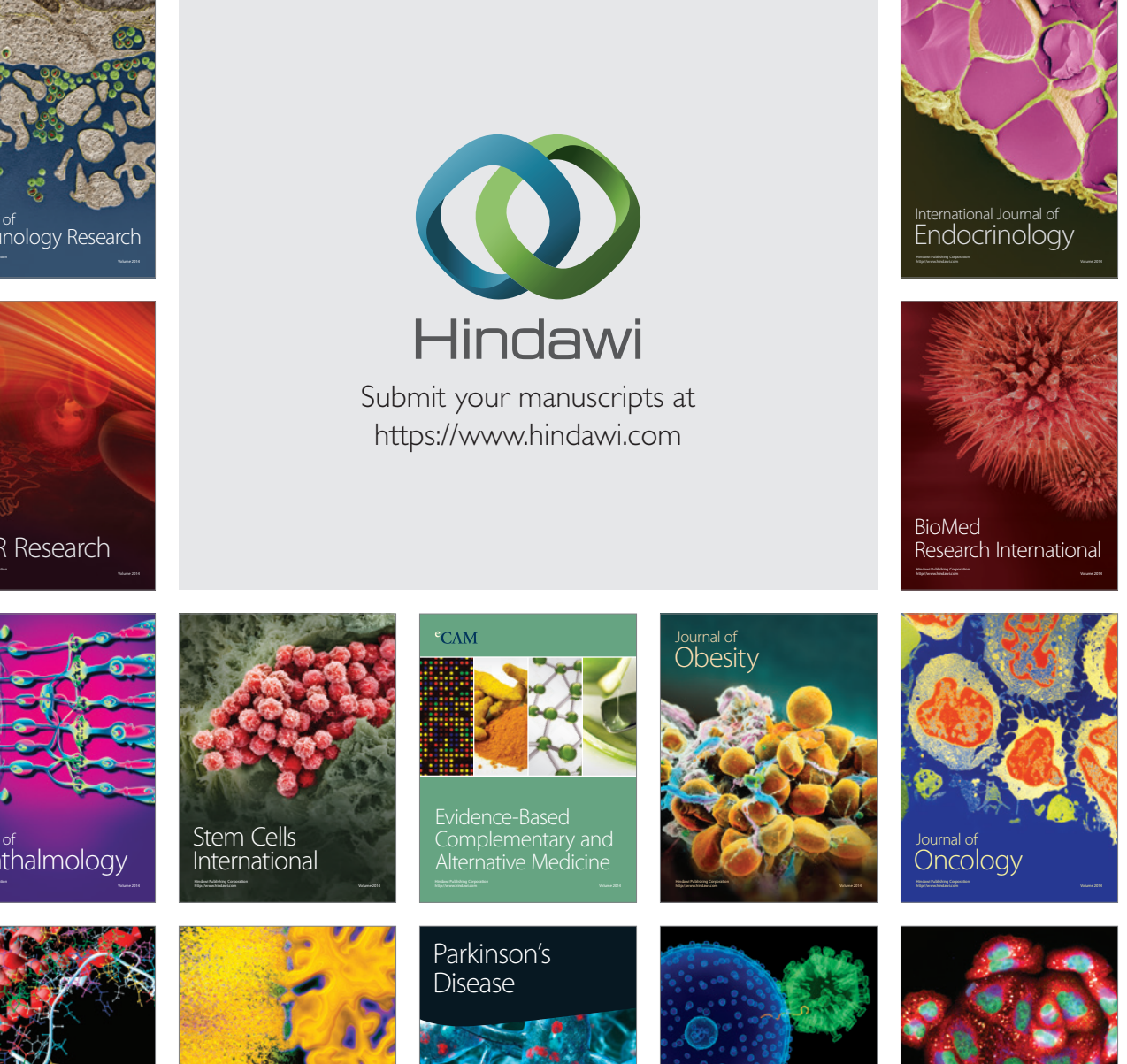
Oxidative Medicine and Cellular Longevity