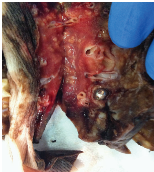
FIGURE 2: Gross image of the excised lower lobe of lung with foreign object imbedded in a terminal bronchiole. Note the necrotic lung tissue distal to the obstructed bronchiole.

Postoperatively the patient returned to the ICU extubated, only on 2 liters via nasal cannula. The patient was discharged from the ICU on postoperative day 2, and spent five days on a medical/surgical step-down unit before being discharged to a rehabilitation facility. When discharged from the hospital, the patient was off all antibiotics and was only on a steroid taper as well her asthma medication regimen she was on prior to getting pregnant. After a two-week stay in an