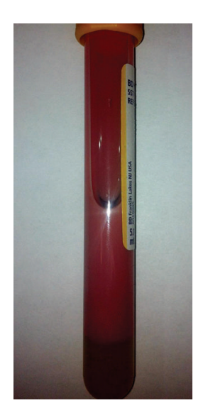
FIGURE 2: Patient's serum sample with lipemic appearance on day 1 of admission.

of 7 mmol/L and calcium 4.5 mg/dL (normal range: 8.4–10.2 mg/dL). Her APACHE II score was placed at 13 and Ranson's at 3, thus predicting maternal mortality from acute pancreatitis at 18%.