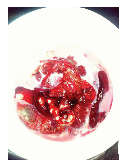
FIGURE 1: Placenta covered with milky fluid suggestive of severely increased serum lipid levels.

AST: aspartate aminotransferase; ALT: alanine aminotransferase; TSH: thyroid stimulating hormone.