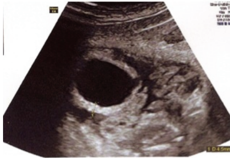
FIGURE 1: Rupture of detrusor and hypertrophic bladder.