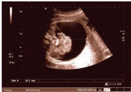
FIGURE 2: Urinary ascites.

prognosis, a pregnancy termination was discussed with the parents.