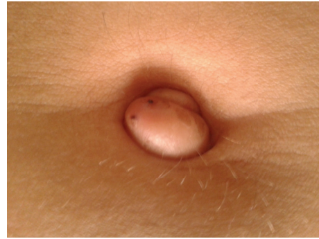
FIGURE 2: Umbilical nodule.

Abdominal examination was otherwise normal with no clinical signs of hernia. The first ultrasonography of the umbilical nodule revealed an image suggestive of dermoid cyst. Pelvic computed tomography (CT) scan revealed two contiguous cystic images with peripheral contrast enhancement in the left adnexal area that were included in the differential diagnosis of endometrioma, tubo-ovarian abscess, and serous cystadenoma. A second ultrasound scan of the lesion revealed two superficial cysts measuring 2 mm and another deeper cyst measuring 4 mm, with nonspecific aspect, though compatible with sebaceous or dermal inclusion cysts. Magnetic resonance imaging (MRI) showed uterus measuring 92 × 40 × 58 mm, with multiple small nodules showing signal hypointensity on T2-weighted imaging regarded as intramural leiomyomas and the presence of some endometrial glands suggesting adenomyosis, endometrium with 6 mm (Figure 3). MRI also revealed a left septated ovarian cyst measuring