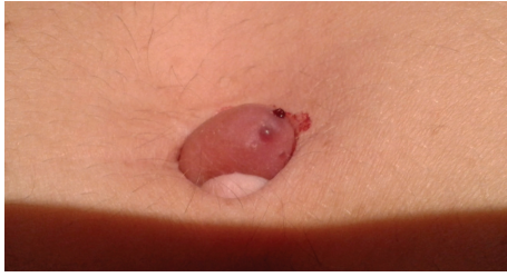
FIGURE 1: Umbilical nodule bleeding during menstrual cycle.

The authors report a case of a patient with umbilical endometriosis associated with a previous laparoscopic intervention and treated by surgical excision.