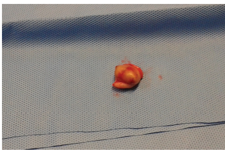
FIGURE 5: Umbilical nodule resected.

structures (the implantation or retrograde menstruation theory) [3]), haematogenous or lymphatic dissemination of endometrial cells (the dissemination theory), ectopic differentiation of pluripotent peritoneal progenitor cells to endometrial tissue (coelomic metaplasia theory) [3, 24, 25, 30], production of substances to form endometriosis by sloughed endometrium (the induction theory), specific stimulation to a Müllerian origin cell nest producing endometriosis (the embryonic rest theory), and proliferation of ectopic