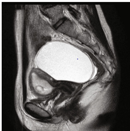
FIGURE 1: Sagittal T2-weighted MRI examination showed the possibility of benign ovarian cyst.

At 14 weeks and 0 days of gestation, the patient suddenly complained of severe left abdominal pain. On suspicion of torsion, the patient underwent emergent laparotomy. During surgery, 10 cm × 8 cm multiple left ovarian cysts and one rotation of the cyst were noted. With a diagnosis of torsion of ovarian cyst, we performed cystectomy of the left ovarian tumor. As a 1 cm sized small nodule on the wall of the specimen was noted, we performed careful exploration and washing cytology. The right ovary, uterus, and other intra-abdominal regions were normal. The postoperative course was uneventful. The final pathology was consistent with high-grade mucinous adenocarcinoma, endocervical type (Figures 2(a) and 2(b)). Washing cytology was negative. After a discussion involving the patient and her family, gynecologic oncologist, and maternal-fetal medicine specialist, secondary laparotomy as fertility-sparing surgery was selected.