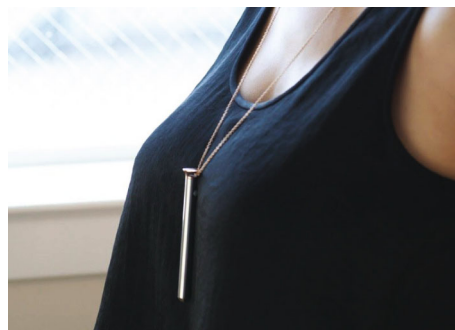
FIGURE 3: Vesper™ vibrator shown being worn as a necklace.

To provide the highest level of care and treatment of a foreign body, it is necessary to have the best understanding of the offending object possible [6–8]. Most gynecologists are intimately familiar with sex-related injuries and the related possible morbidities. One assumption that most gynecologic