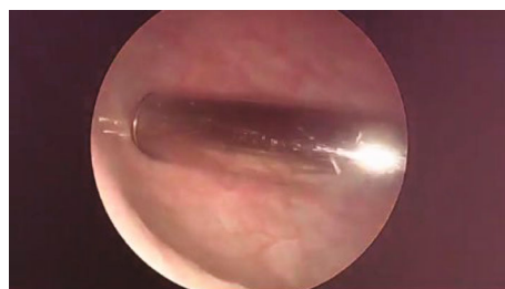
FIGURE 5: Device visualized in the bladder at the time of cystoscopy.

surgeons would generally make when assessing a situation such as this is that any standard vibrator would be of too great of a caliber in order to fit into the patient's urethra [9, 10]. In this case however, this uniquely narrow vibrator was later measured to be approximately 1.2 cm in total diameter, which is approximately the same diameter of a 36 French catheter [11, 12]. Therefore, when the device became lodged in the patient's urethra, sexual activity pushed the device into the bladder and the device became lodged in the bladder without puncturing it [13, 14].