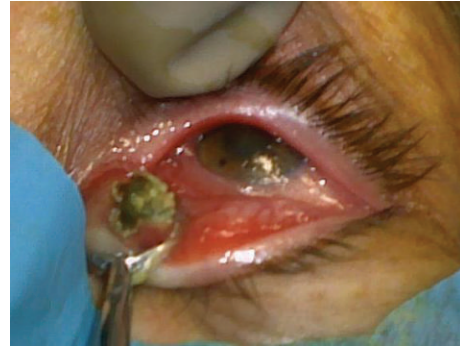
FIGURE 1: The incision perpendicularly revealed the content of the abscess.

Apart from canaliculitis Actinomyces is documented to cause various ophthalmic infections, such as blepharitis, conjunctivitis, keratitis, dacryocystitis, and postoperative