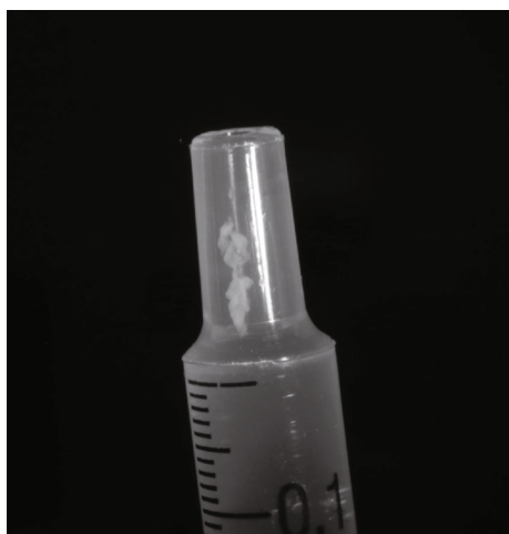
FIGURE 2: After removing the filter cannula, a kind of clot was observed that had not previously been seen on the syringe supplied.

party supplier. Therefore, it was not further investigated what exactly the bearing material consisted of.