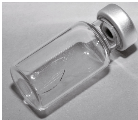
FIGURE 1: After a light and short contact with the filter cannula, fine continuous cracks on the glass vial were seen. Although no Afibercept solution had escaped, the active ingredient—possibly no longer free of contamination—was not used.