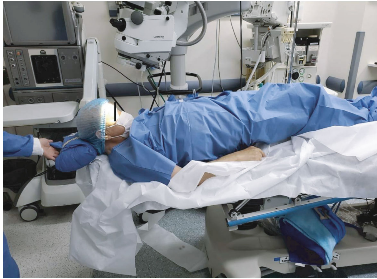
FIGURE 1: Patient in Trendelenburg position with a support pad on the head and neck in a modular surgical bed.