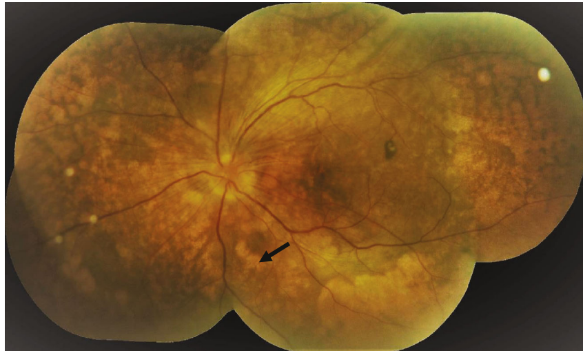
FIGURE 2: A VKH patient presenting in chronic stage with sunset glow fundus, multiple nummular chorioretinal depigmented scars, and pigmentary changes.