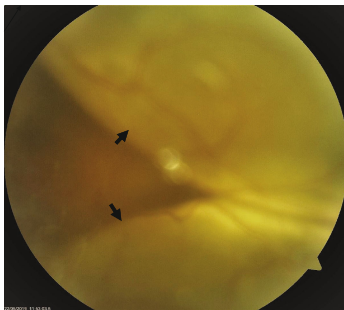
FIGURE 1: A VKH patient presenting in acute uveitic phase with bullous exudative retinal detachment (black arrows).

corticosteroids initiated during the early acute uveitis stage followed by slow tapering is required to suppress the inflammation. Addition of immunomodulatory agents along with steroids can improve the visual outcome and can also decrease the risk of cutaneous involvement [1].