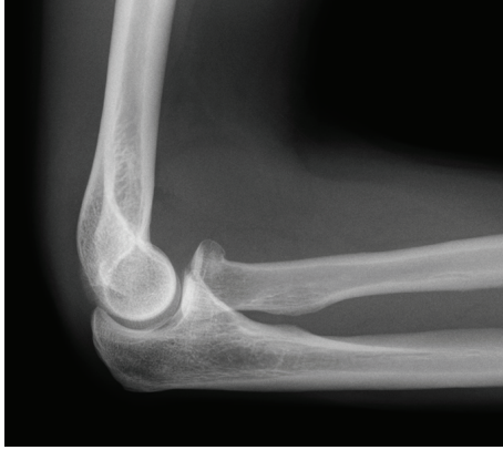
FIGURE 1: Mason I radial head fracture.