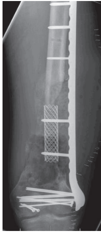
FIGURE 3: Composite fixation consisting of lateral locking distal femoral plate with endosteal titanium cage augment.