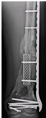
FIGURE 4: Radiograph demonstrating remarkable regrowth of new bone surrounding the endosteal titanium implant at 8 months post-procedure. Note the contour of the new bone, formed within the pseudocapsule which resulted from the initial antibiotic cement spacer used in the first stage of the Masquelet technique.

membrane was encountered with evidence of aggressive callus formation already in place at the site of the antibiotic cement spacer (Figure 4). The pseudomembrane was cleanly incised anteriorly, and the antibiotic spacer was broken up using an osteotome and the fragments were removed. The composite fixation component of the procedure was then introduced by placing a titanium cage fixed into place and extending from the proximal diaphyseal fracture limit to the distal femoral fragment, within the confines of the pseudomembrane (Figure 3). This cage was attached to the lateral plate with screws, providing stabilization for the construct from within as well as the outside of the segmental fracture.