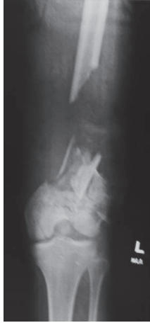
FIGURE 1: Original injury depicting 17 cm of segmental bone loss in the distal metadiaphyseal aspect of the right femur.

published support for superiority of either technique at two years, were thoroughly discussed [1]. Despite the probability of multiple surgeries over the course of approximately the next year, the attendant risks of each surgery, and the very real possibility of enduring pain and challenging control measures, the patient opted for the limb salvage option. We then set about formulating a surgical plan to provide the best possible outcome to that end.