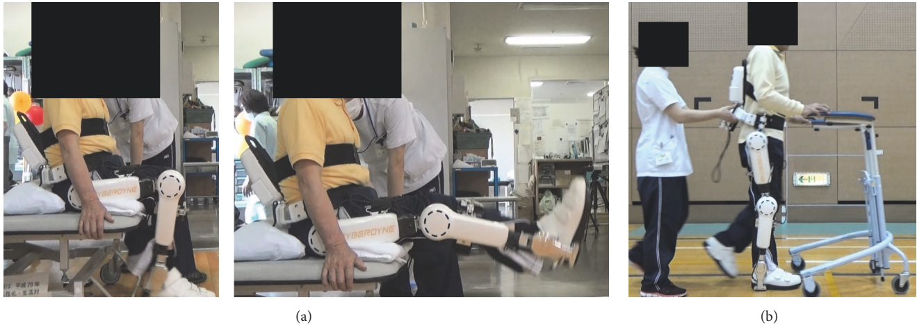
FIGURE 1: Photo of the hybrid assistive limb (HAL) on the patient (a). The patient is a 76-year-old male who underwent right TKA for grade 4 knee OA (Kellgren-Lawrence scale). Photo of the HAL training during walking (b).

palpation. The HAL was set with the patient seated. Before HAL training, the patient underwent bilateral plain radiography performed by a radiology technician using Rosenberg's 45° flexion load-bearing view and one orthopedic surgeon interpreted the radiograph of the patients. By the result of the radiograph, we confirmed that the patient was not suffering from osteoporosis or deformation to the lower extremity. In addition, we confirmed whether dizziness occurs by interrogation. After the subject confirmed the waveform of electromyogram (EMG) while extending the knee joint with HAL, we checked whether muscles contraction occurs with regular timing during walking.