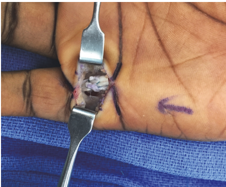
FIGURE 2: Given the extent of tendon disruption, the FDP was repaired and tubularized with 3-0 Ethibond suture.

ring finger metacarpophalangeal (MCP) joints. There was otherwise no extensor lag, and the patient was able to make a full composite fist.