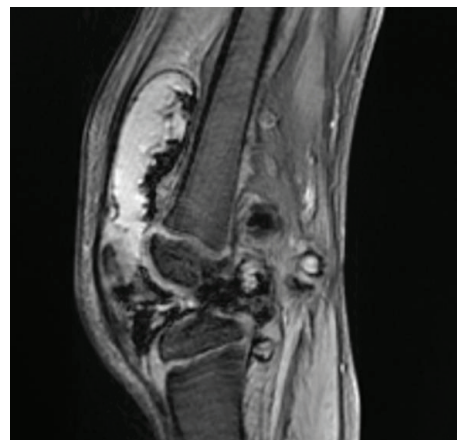
FIGURE 3: MRI, T2 sequence of the left knee: important joint effusion.

The clinical examination revealed classical features of this syndrome including small hypertelorism, mild ptosis, downslanting palpebral fissures, low-set and posteriorly angulated