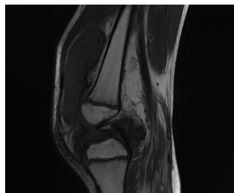
FIGURE 4: MRI, T1 sequence of the left knee: visible villonodular thickening of the synovial membrane with hemosiderin deposition.