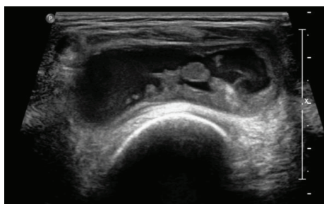
FIGURE 2: Ultrasounds of the left knee joint showing a joint effusion with villous hyperplasia of the synovial lining.