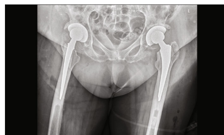
FIGURE 2: Postoperative anteroposterior X-ray of the pelvis.