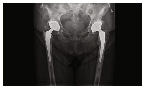
FIGURE 3: 8 weeks of follow-up anteroposterior X-ray of the pelvis.

The advantages and disadvantages of one-stage versus two-stage bilateral THA have been discussed for decades [11]. Single anesthetic administration, shorter hospital stay, faster rehabilitation, and lower procedure costs support 1-SBTHA. However, it remains controversial due to the safety concerns regarding the anesthetic risks and increased blood loss associated with 1-SBTHA [12]. A large study using prospectively collected data by Aghayev et al. [5] reported fewer postoperative local and systemic complications and a superior outcome in terms of postoperative walking capacity in the 1-SBTHA procedure versus the two-stage THA procedure (2-SBTHA). Shao et al. [6] published the same findings, with a significantly lower risk of major systemic postoperative complications and no difference in mortality rates. Weinstein et al. [7] reported that patients over 75 years of age, who underwent 1-SBTHA, have no increased inpatient mortality risk compared to a younger cohort and have excellent functional outcome after 2.5 years of follow-up. However, other articles have shown that bilateral THA is associated with higher risk of systemic complications, especially pulmonary complications [13, 14]. Due to this