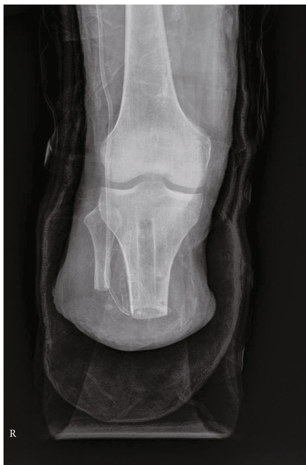
FIGURE 5: Postoperative plane radiograph. No hardware remained after surgery.

postoperative outcomes and increases reoperation rates [5]. Also, because most diabetic patients have some degree of microvascular dysfunction, the risk of surgical site disruption is high [6]. Therefore, additional incisions to remove the tibial IM nail increase the rate of surgical wound complications. The second problem is iatrogenic trauma around the knee joint that can occur during IM nail removal. Patients who undergo below-knee amputations are more likely to develop patella subluxation or dislocation. One of the causes is the insufficiency of the medial patellofemoral ligament [8]. Therefore, in these knees, patella subluxation or dislocation can occur with minor trauma [7]. To remove a tibial IM nail, a transpatellar or parapatellar approach is used [10]. However, it is possible to damage the soft tissue around the patella while approaching, and more damage may be caused while manipulating the knee joint to remove the nail. These injuries may increase the possibility of patella dislocation in the future.