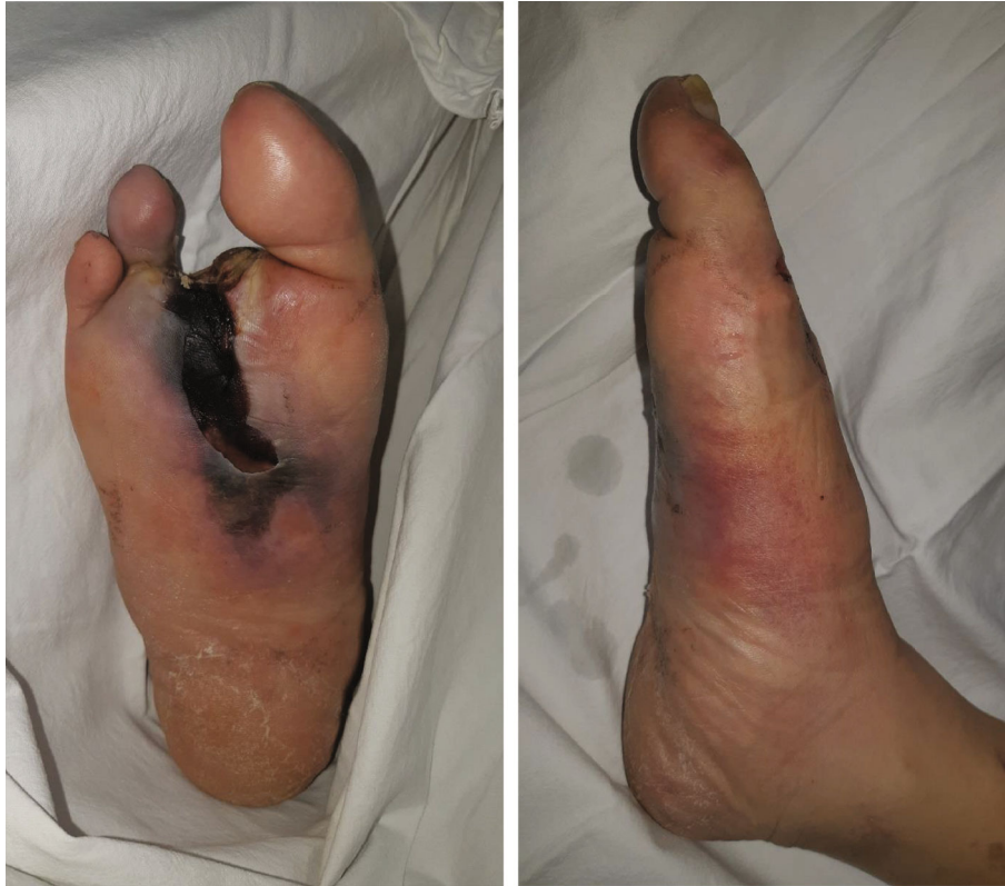
FIGURE 1: Clinical photographs of the right foot. Active infection and necrosis were limited to the feet.

patient. However, it was determined that the blood flow to the distal part of the popliteal artery was intact. Also, infection and necrosis had not progressed beyond the foot. The skin color of the right calf seemed healthy on physical examination. Therefore, we decided to remove the tibial IM nail and perform a below-knee amputation. However, performing additional surgery around the knee joint to remove the tibial IM nail was thought to have a high possibility of complications. Thus, surgery was planned to remove the amputated limb and IM nail at the same time by performing an amputation with the nail fixed on the ankle by distal locking screws.