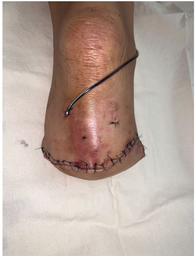
FIGURE 4: Postoperative photograph of the right lower extremity. No additional incision was applied to remove the IM nail except a mini-incision for the removal of the proximal interlocking screw.

shaped posterior flap. After irrigation and drainage insertion, the deep fascia and skin were sutured without tension (Figure 4). No hardware remained after surgery (Figure 5).