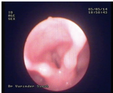
FIGURE 2: Clinical photograph showing paralyzed true vocal cords in paramedian position just after tracheostomy.