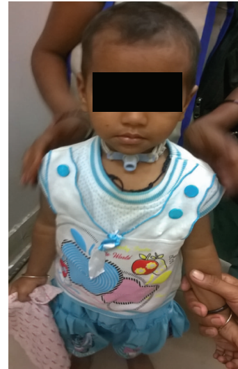
FIGURE 3: Clinical photograph of the patient at 6-month follow-up.

Bilateral vocal cord palsy is a life threatening complication which always presents with acute respiratory distress. All the previous cases required assisted ventilation, and some failed extubation (Table 1). Interestingly, our case had no