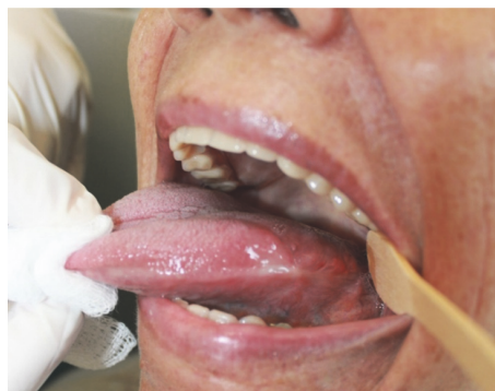
FIGURE 11: Postoperative month 18.

Hausamen [12], for 3 years, successfully treated several diseases of the oral cavity, including hemangioma, leukoplakia, and squamous cell carcinoma. In agreement with the results obtained and reported in the literature [2, 13–15], in