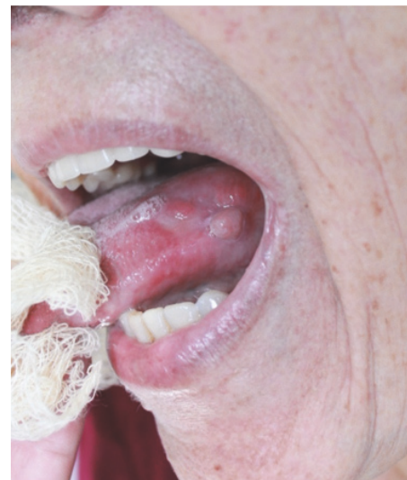
FIGURE 10: Postoperative week 8.