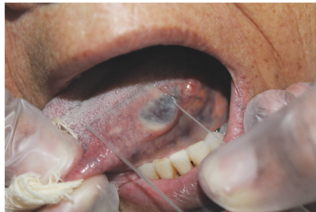
FIGURE 2: Diascopy (pressure on the lesion with a glass slide) showing color change.

ensure the safety margin without causing major defects, since it destroys deep diseased tissue through in situ freezing [11].