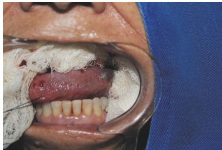
FIGURE 4: Tongue pulled to the right and adjacent tissues protected by gauze with Vaseline.