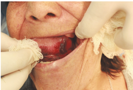
FIGURE 7: Postoperative week 1.