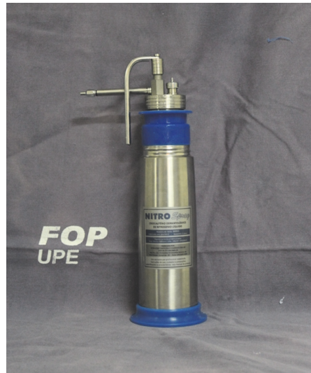
FIGURE 3: Cryocautery system: liquid nitrogen container and pump system used in the present case.