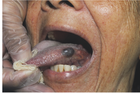
FIGURE 1: Hemangiomatous lesion on the left lateral border of the tongue.