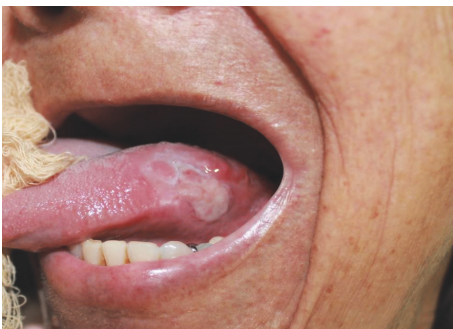
FIGURE 9: Postoperative week 6.