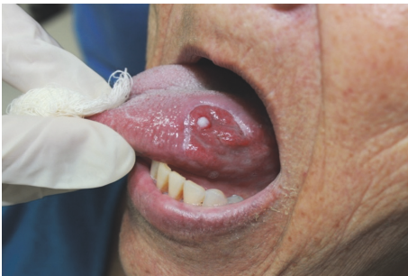
FIGURE 8: Postoperative week 3.