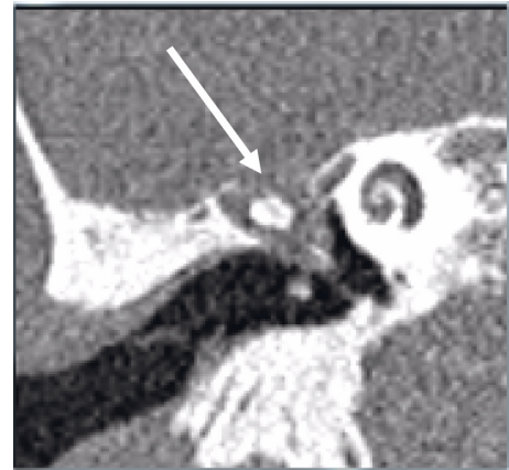
FIGURE 1: CT scan with the defect shown: high-resolution CT petrous bones (coronal view).

This finding was picked up on follow-up scans. Had it been picked up earlier, it could have affected the management plan for subsequent episodes of OM, with low threshold for surgical management through myringotomy and grommet insertion, thereby avoiding the spread of sepsis. Moreover, early consideration of surgical repair of the tegmen defect should be considered to prevent further cases of intracranial spread of infection. Such surgery would usually require joint ENT and neurosurgical input.