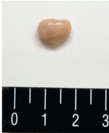
FIGURE 1: Gross specimen image. The specimen was sized at approximately 10 mm in diameter.