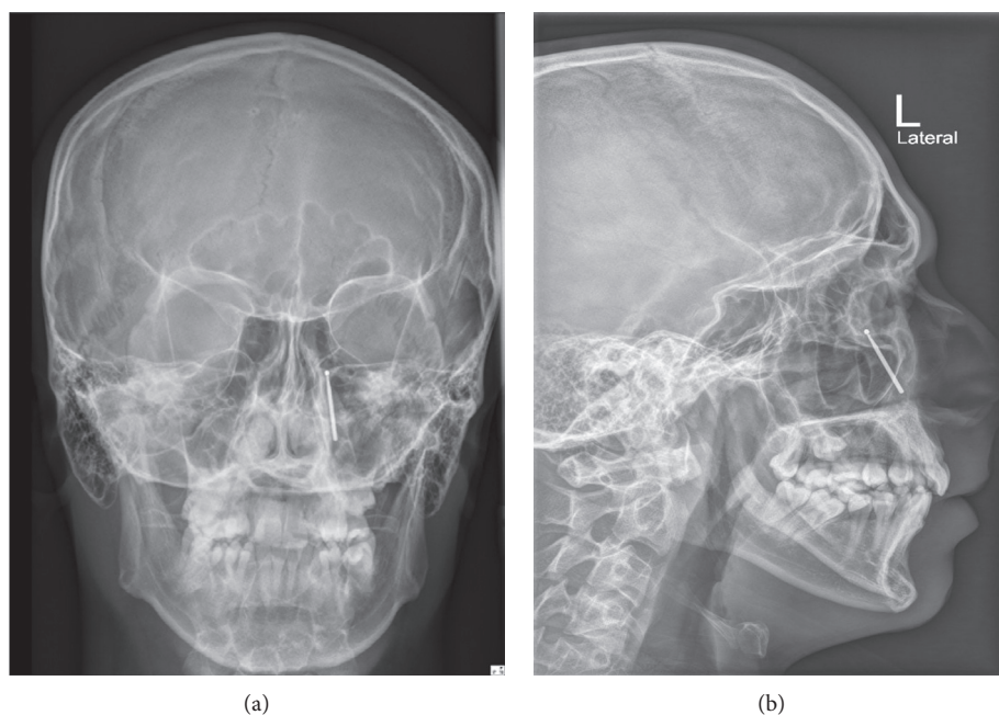
FIGURE 1: The anterioposterior and lateral view X-ray showing the radio opaque foreign body situated in the left maxillary sinus with head of the foreign body pointing posteriorly.