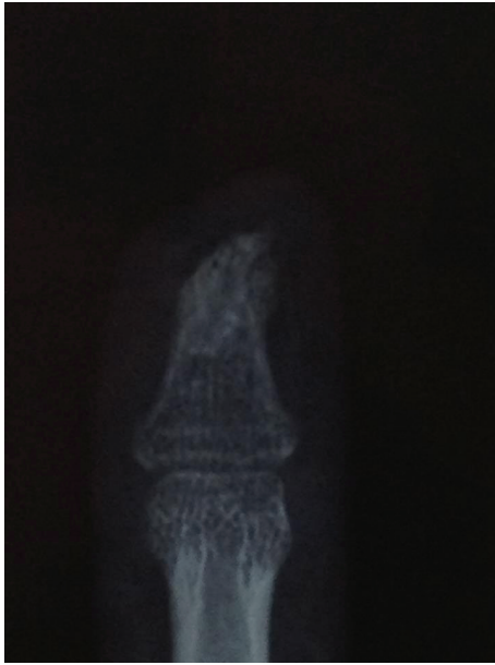
FIGURE 1: Erosion of the distal phalanx beneath the epithelioid sarcoma.

heal despite the repeated therapeutic efforts. An X-ray was performed (Figure 1) that showed the characteristic distortion and erosion of at least half of the distal phalanx beneath the dermal nodule. A partial biopsy of the subungual tissue was performed and it was sent to the Pathology Department of Evangelismos Hospital.