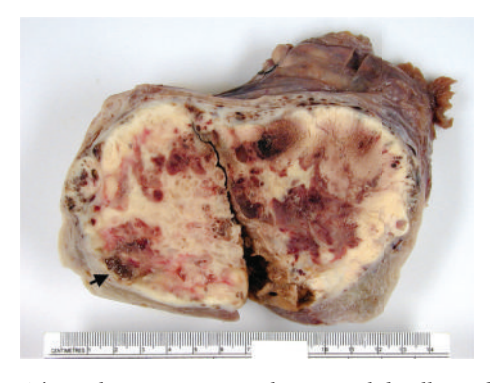
FIGURE 1: The right ovarian mass shows a solid yellow white sectioned surface with areas of necrosis and hemorrhage. A small gelatinous focus is observed (arrow).

Microscopically, the ovarian mass was composed of relatively uniform cuboidal to columnar cells with round to oval nuclei, predominantly arranged in a tubular pattern (Figures 2(a) and 2(b)). Dilated gland-like spaces with papillarylike infolding lined by elongated columnar cells simulating