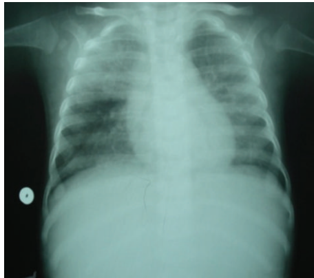
FIGURE 1: Chest X-ray: bilateral alveolointerstitial infiltrate.