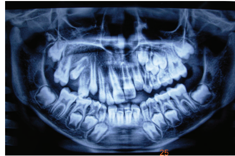
FIGURE 3: Orthopantomographic view showing the right side osseous enlargement of maxilla with drifting of teeth.

Maxillectomy was advised for enlarging maxilla. But patient's parents were unwilling for the surgical resectioning of maxilla; hence, the patient was instructed for plaque control measures which included oral prophylaxis at regular interval, oral hygiene instructions, and plaque index scoring. Mobile deciduous right molars were extracted under local anesthesia. Postextraction healing was uneventful.