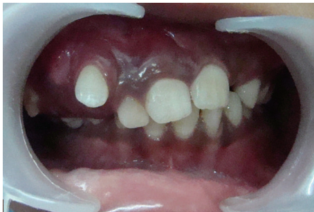
FIGURE 2: Intraorally unilateral reddish discoloration of gingiva (port wine stain) with osseous enlargement, drifting of teeth, and malocclusion.

labial frenum to the first molar region with osseous enlargement and drifting of teeth with retained primary upper right central incisor tooth (Figure 2). Gingiva showed overgrowth (hyperplasia) on the right side with bleeding on probing. Gingival enlargement blanched on applying pressure which was suggestive of angiomatous enlargement. Orthopantomographic examination revealed retained upper primary right central incisor, osseous enlargement on the right side of maxilla with drifting of upper permanent right lateral incisor, canine, and first and second premolar teeth (Figure 3). Maxilla showed asymmetric growth with malocclusion. Further CT scan investigation showed facial asymmetry with marked osseous expansion of maxilla (Figure 4). Diagnosis of Sturge-Weber syndrome with osteohypertrophy with gingival hyperplasia was made based on clinical, radiographic, and CT scan investigation.