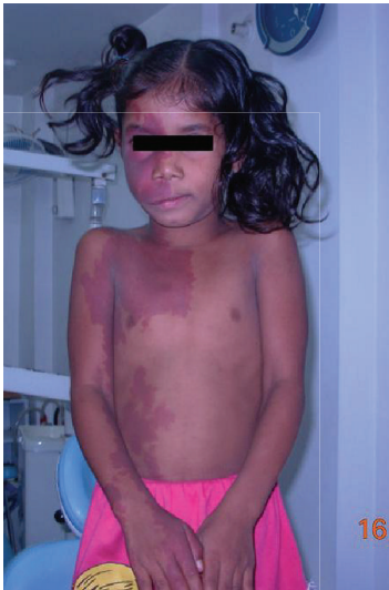
FIGURE 1: Extraoral unilateral involvement of port wine stain on face, neck, chest, abdomen, and hand.