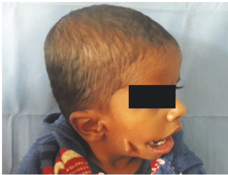
FIGURE 2: Side profile patient.