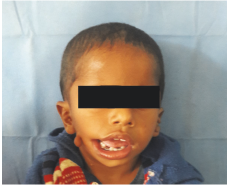
FIGURE 1: Frontal profile of patient.