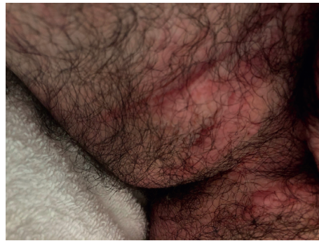
FIGURE 2: Improvement following 8 months of treatment with adalimumab.