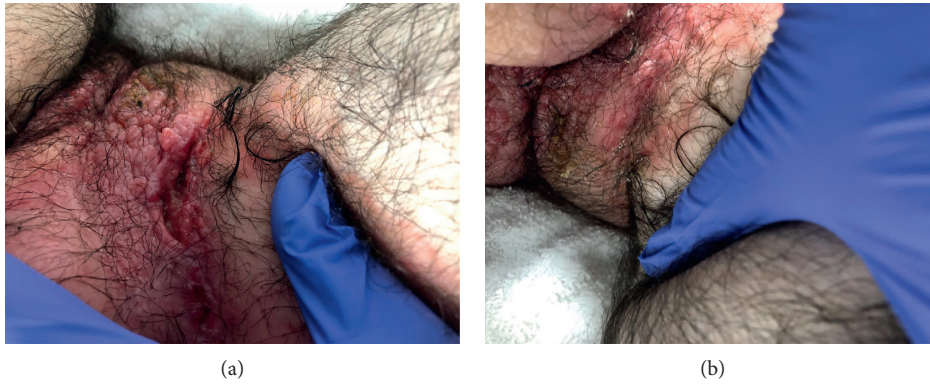
FIGURE 1: Well-demarcated erythematous plaques, nodules, and papules noted on the groin (a) and gluteal cleft (b) observed prior to treatment with adalimumab.