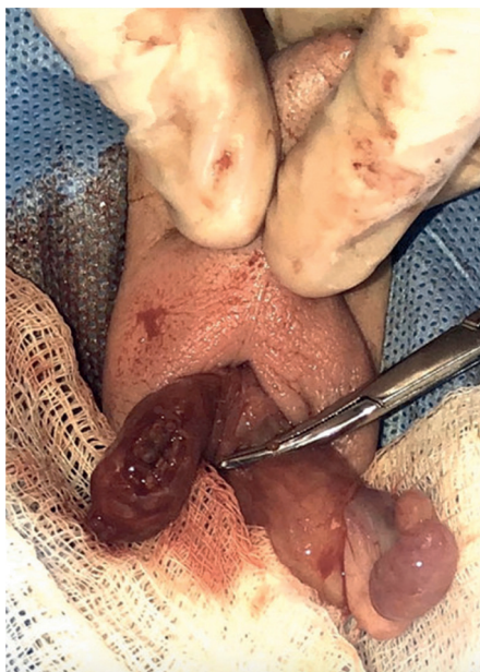
FIGURE 3: The incision of the scrotum along the raphe, revealing a discolored, edematous, and necrotic right testicle, with normal appearance of the left testicle. Orchiectomy of the right testicle was followed by contralateral orchiopexy.

gestation, an observational approach is advocated. This rare and hypothetical case of bilateral synchronous torsion diagnosed antenatally requiring intervention has also been proposed by others [12].