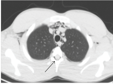
FIGURE 1: CT lung windows showing pneumomediastinum and pneumorrhachis (black arrow).