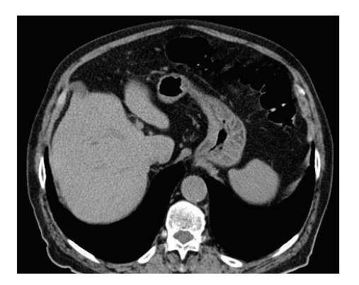
FIGURE 3: Transverse CT image showed the complete disappearance of gas in mesenteric vein and portal venous system, 24 hours after the CTC.

Colonic perforation is a recognized complication of optical colonoscopy and it is reported to a rate of 0.06%-0.19%;