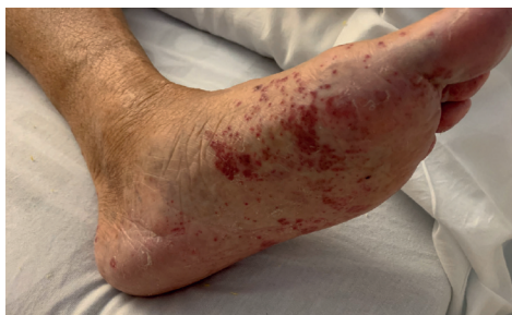
FIGURE 1: Rash of the left lower extremity.