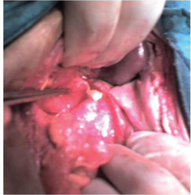
FIGURE 2: Proglottid of Taenia saginata coming out of gall bladder.

Acute cholecystitis and cholangitis has been associated with a wide range of infectious agents including various helminths. Parasites known to be associated with this condition include Ascaris lumbricoides and Clonorchis sinensis [12]. These are both wandering helminthes with no attachments in the intestine and can easily traverse the ampulla and reach the biliary tree. Since Benedict [6] reported the first biliary migration of Taenia saginata , it has been a matter of speculation as to how Taenia reaches the biliary tree.