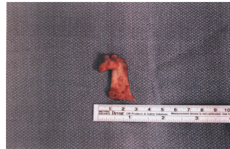
FIGURE 4: Resected osteochondroma and coronoid process.

Histopathologic analysis was consistent with the dense bone and associated portion of cartilage. Postoperatively, after physical therapy with Therabite, the patient was able to obtain an opening of greater than 40 mm (Figure 5).