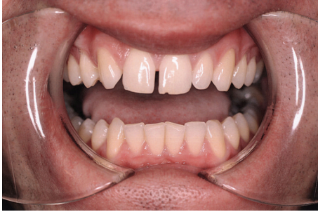
FIGURE 1: Physical examination reveals interincisal opening of 10 mm.