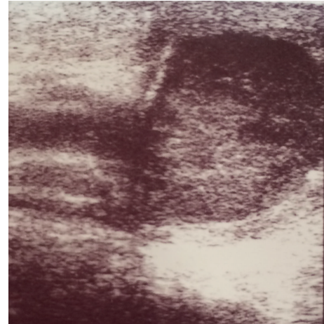
FIGURE 3: Ultrasound study shows the right testis with edematous appearance suggesting the presence of pyocele. This could be due to perforated appendicitis.

Amyand's hernia is a rare entity that occurs in about 0.1% of all acute appendicitis [4]. Regarding the pathophysiology of Amyand's hernia, bacterial overgrowth is a result of poor blood supply as a subsequent of either incarceration due