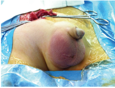
FIGURE 1: Right erythematous and testicular swelling mimicking acute scrotum.