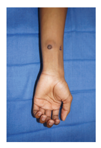
FIGURE 1: Volar view of forearm.