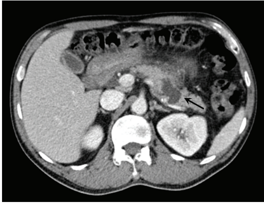
FIGURE 1: 4.1 cm pancreatic pseudocyst in distal pancreatic body (marked by arrow).

fluid revealed it to be exudative with a fluid amylase level of >2000 units/L. Fluid cultures grew Klebsiella pneumoniae and a culture-directed course of antibiotics was prescribed. In view of the high pleural fluid amylase levels, a diagnosis of a PPF was made and he was given octreotide 100 mcg 8-hourly subcutaneously for 5 days. The pleural drain was left in situ for 7 days and it drained 2.5 litres of haemoserous fluid in total prior to removal.