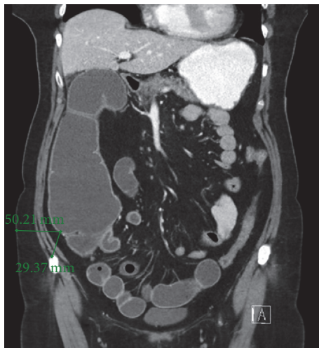
FIGURE 3: Coronal CT showing caecum measured from the anterior superior iliac spine and the lateral abdominal wall.

to be approximately 3 cm from the skin and there were no small bowel loops between it and the abdominal wall (Figure 4). The patient was positioned in the partial left lateral position to utilise gravity to mobilise the small bowel away from the caecum. The needle entry point was measured and marked on the skin. Under aseptic technique and local anaesthetic (1% lignocaine), a 21-gauge needle (0.51 mm inner diameter) attached to a 5 ml syringe was inserted through