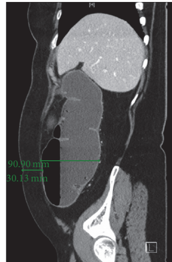
FIGURE 4: Sagittal CT showing caecum measured from the anterior abdominal wall.

to be approximately 3 cm from the skin and there were no small bowel loops between it and the abdominal wall (Figure 4). The patient was positioned in the partial left lateral position to utilise gravity to mobilise the small bowel away from the caecum. The needle entry point was measured and marked on the skin. Under aseptic technique and local anaesthetic (1% lignocaine), a 21-gauge needle (0.51 mm inner diameter) attached to a 5 ml syringe was inserted through