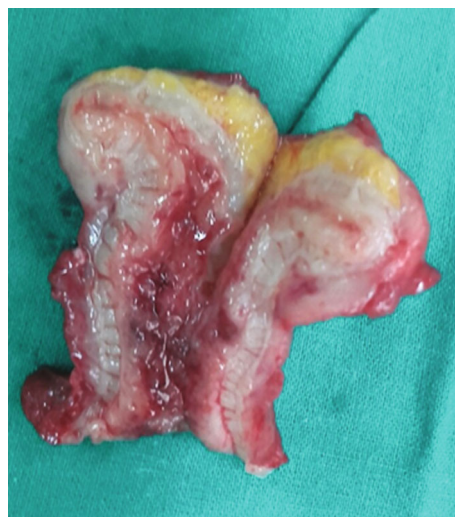
FIGURE 2: Cut section of the appendix showing an oedematous wall with significant mural thickening.

older female is unusual. In such cases, visualisation of the colon and distal ileum or imaging is mandatory to look for colonic malignancies and tuberculosis. Our patient did not have any significant findings on endoscopy, and serial biopsies were unremarkable.