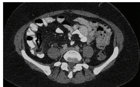
FIGURE 1: Axial CT abdomen with oral contrast showing caecal epiploic appendagitis with minor pericaecal fat stranding (vertical white arrow).

Ultrasonography scan (USS) of the abdomen has some characteristic features to diagnose epiploic appendagitis [8]. Nevertheless, the CT scan is the gold standard of diagnosis [1]. Typical tomographic signs are 2-3 oval-shaped lesions with central hyperattenuation corresponding to a thrombosed draining vein, thickened peritoneal linings, and inflammatory changes within the