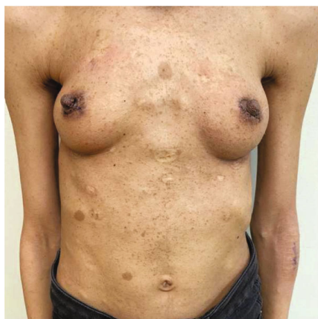
FIGURE 4: Postoperative day 7 showing healed bilateral nipple after lesion excision.

breast masses. These lesions caused mild pain and deformity of her nipples and were approached by simple excision while preserving the duct. This was executed by circumferentially excising the redundant nipple-areolar skin containing the neurofibromas, while isolating the nipple on a central ductal and vascular pedicle. The nipple was finally sutured to the remaining areola using 5.0 prolene.