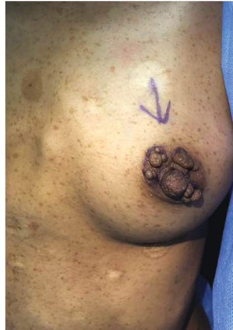
FIGURE 2: Multiple pedunculated lesions around left nipple preoperative.

ful clinical and mammographic screening of the breast during adulthood to determine the presence or absence of malignancies [6]. Breast neurofibromas are uncommon NF1 manifestations that develop on the nipple-areolar complex [6]. According to the literature, women with NF1 have a higher risk of breast cancer than the general population; nevertheless, there are no special screening recommendations for these patients [7]. Thus, if cutaneous neurofibromas cause pain or are bothersome, they should be surgically removed [8], as in the presented case.