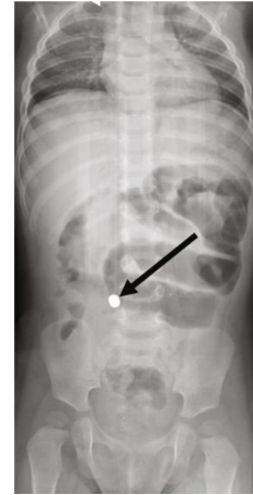
FIGURE 1: Dilated bowel loops with a radioopaque foreign body (indicated with an arrow).

Many of the small foreign bodies that are ingested are managed conservatively by watchful waiting and serial X-ray images; however, in cases of multiple ingestion, X-ray imaging may not be very helpful as magnets can be mistaken for other less harmful inorganic foreign bodies (e.g., pearl) or may be indistinguishable from other metallic foreign bodies