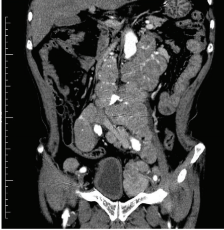
FIGURE 1: Abdominal computed tomography showing para-aortic and pelvic lymph node enlargement.

imaging revealed numerous enlarged lymph nodes in the pelvis. Bone scintigraphy revealed hot lesions on several ribs and the second lumbar vertebra. Prostate biopsy revealed adenocarcinoma (poorly differentiated, Gleason score 5 + 4). Antiandrogen treatment with bicalutamide (80 mg orally) was started, and after 14 days leuprolide was added (3.75 mg subcutaneously once a month) to the regimen. Twenty-eight days after the first subcutaneous injection of leuprolide, there was approximately 50% in the t-bil levels (from 17 to 10.5 mg/dL). After further 2.5 months, there levels returned to normal (Figure 3) following which AST, ALT, and ALP levels returned to normal 2 months later.