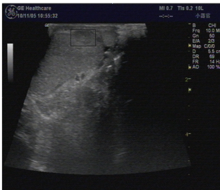
FIGURE 1: Scrotal ultrasonography of AT: scrotal ultrasound scan revealing a 10 × 8 mm, hyperechoic solid mass in the upper pole of the left testicle.

RT: right testis; LT: left testis; FNA: fine needle aspiration. RO: radical orchiectomy.