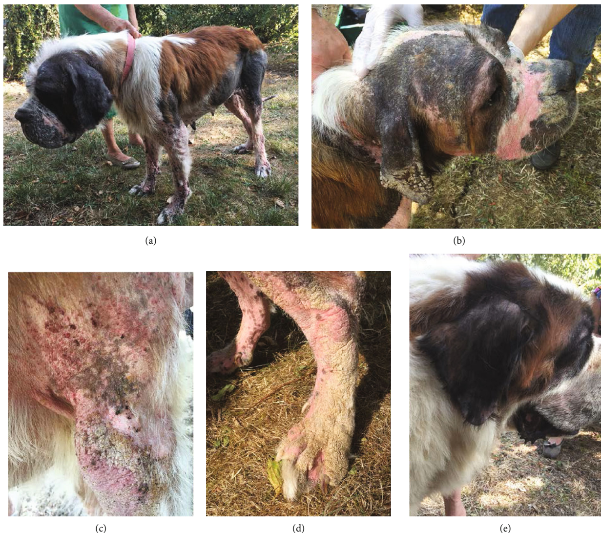
FIGURE 1: Initial physical examination. Extensive alopecia and poor body condition (a); close view of the head: alopecia, erythema, crusts, and scaling localised mainly on the convex aspect of the pinna and muzzle (b). Self-inflicted lesions associated with alopecia, papules, and thick crusts on the shoulder and elbow (c). Alopecia, erythema, and thick scaling/crusting on the distal part of a hind leg (d). Least-affected dogs only showed alopecia on the pinnae and face (e).

Two weeks later, the cutaneous score was 92.5 on average (min 37, max 146), corresponding to a decrease of 47% as compared to day 0. Skin scrapings were negative for all but three animals. Three dead adult mites were found on two dogs, and a single egg was observed on the third dog. The pruritus score was nil and subsequently remained as such.